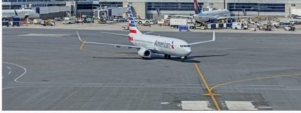
An American Airlines 737-800 taxiing at Boston Logan International Airport.